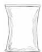
Pillow without gusset