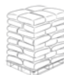
Full bag pallet