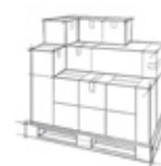
Mixed load pallet